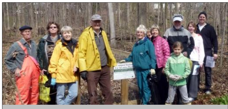
Church Woods Team battle against invasive species

helped to clear brush piles, built containers to recycle invasive species and helped to manage, assess and nurture 39 properties.