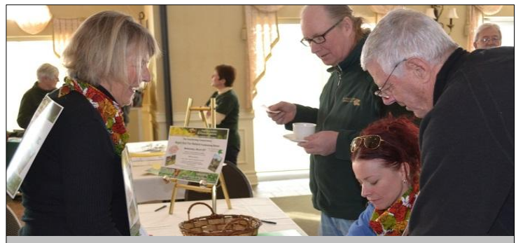
Many people contributed to make the Bird Carving Raffle,

to plan events, sell tickets, ask businesses for auction items, attend community events, stuffed envelopes, baked pies, and helped in a many other ways throughout the year.