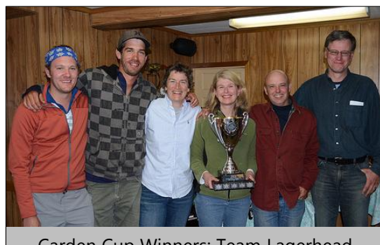
Carden Cup Winners: Team Lagerhead