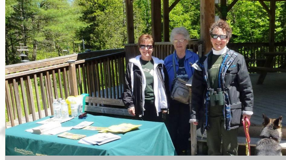
Doors Open Orillia – Grant's Woods