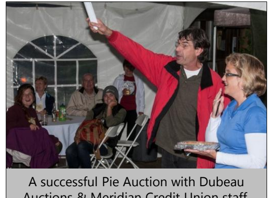
Auctions & Meridian Credit Union staff.

The 9th year of the Challenge was a record year for species! Eleven teams collectively raised over $22,000 for the stewardship of the Carden Alvar and spotted 158 bird species in 24 hours.