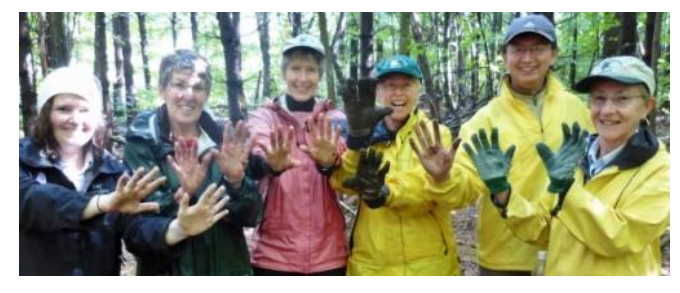
Left to right: Partnering with the Nature Conservancy of Canada to pick dog-strangling vine pods. Leadbeater Easement, a 218 acre property near Raven Lake. Elliott Woods volunteers get their hands dirty picking garlic mustard.