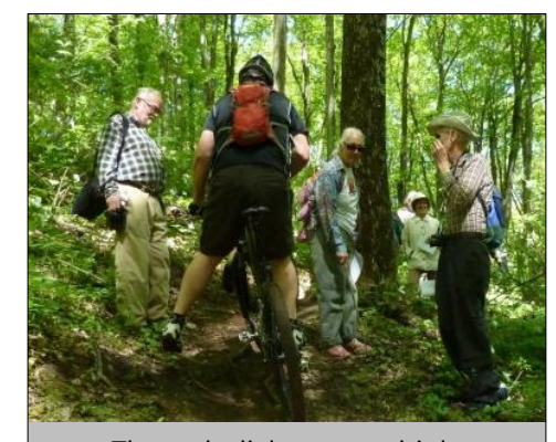
Through dialogue, multiple recreational interests can co-exist.

A grant from Mountain Equipment Co-op's Enviro Fund is allowing the committee to move forward with plans to Incorporate as a Non-Profit, with the blessing of the Ontario Ministry of Natural Resources and Forestry, who own Copeland Forest. This Non-Profit will go on to implement the stewardship recommendations, which were developed in consultation with the public two years ago. Over the long term, the Non-Profit will ensure that the considerable recreational interest in Copeland Forest is balanced with conserving the natural integrity of the forest. The Couchiching Conservancy will continue to support this initiative.