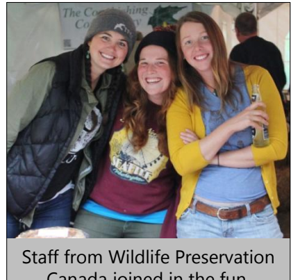
Canada joined in the fun.