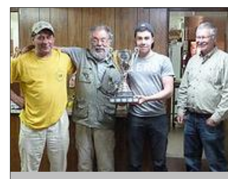
Carden Cup Winners 2014 Wylie Road Runners.