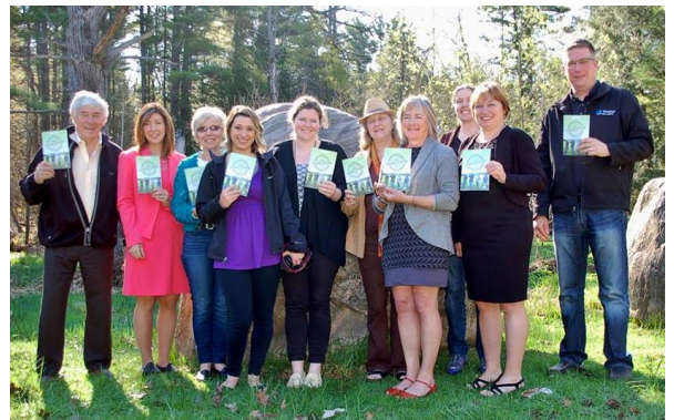
We had great community support for the first Passport to Nature series.