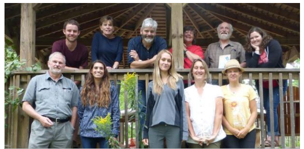
The staff and volunteers of The Couchiching Conservancy.