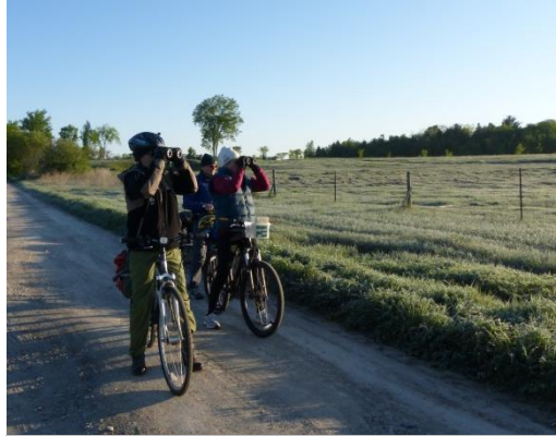
A cold morning of the Carden Challenge, but soon the sun warmed us and the birds came out to sing.

We've had a great year of engaging and fun events at the properties that are protected thanks to supporters. When we were planning for this year, there were a number of goals in mind: to get people out to the properties, increase awareness of conservation work, create new partnerships and raise funds. From the summary numbers to the left, you can see that we have been successful on all fronts.