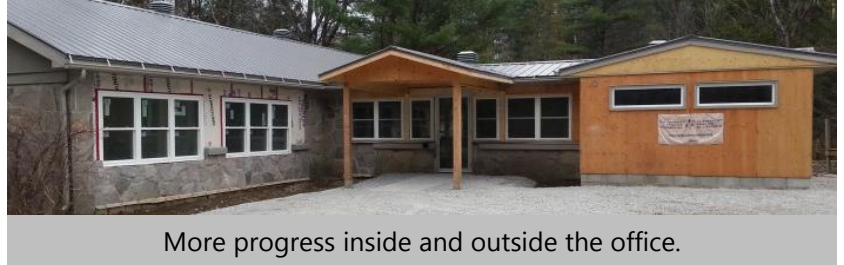
More progress inside and outside the office.