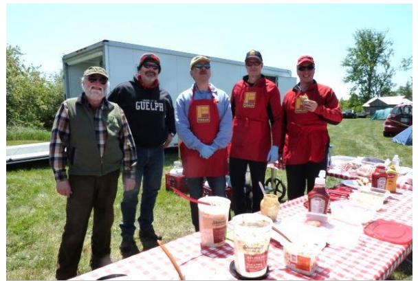
Thanks to Fowlers Construction for the wonderful lunch during the Carden Challenge.