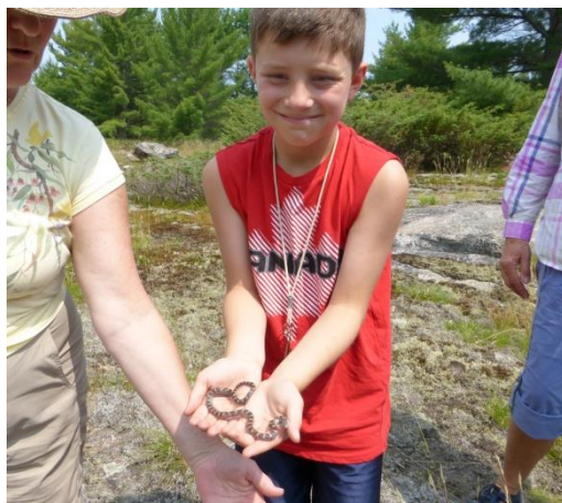
Getting a hands on experience with the wild outdoors at the Roehl Wetland Nature Reserve.

The Passport to Nature is a series of events which take place all year-long across the seasons and this was a perfect way to invite our supporters into the outdoors. It also helped us to grow our group of nature lovers. All of these events are supported by local businesses that care for the environment. Because of their support, these events are free for the public to attend and enjoy. Special thanks to the people on this planning committee for all of their efforts and the event leaders who share their expertise.