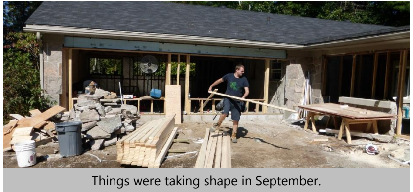
Things were taking shape in September.