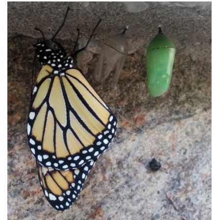
Monarch Butterfly and pupa.

The Couchiching Conservancy remains in a very strong position at the end of our 2014-15 fiscal year. We recorded a small operating deficit at year-end of $529. As budgeted, we drew down some of the funds donated by William Grant to cover the cost of the re-development project at Grant's Woods and we will continue to draw down those reserves until the project is complete in 2016. We also made an adjustment to the valuation of the building, recording a loss on disposal of assets of $41,759 to account for demolition and to arrive at a reasonable valuation for the renovated building. The year saw a $72,064 increase in the Heartwood Fund and an additional $9,350 was added to the Acquisition Reserve. Overall our net assets increased from $3,911,794 to $4,265,972 in 2015, primarily due to a donation of property appraised at $249,900.