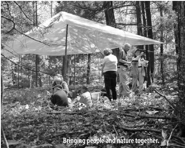
Bringing people and nature together.

We also received grants during 2006 from: