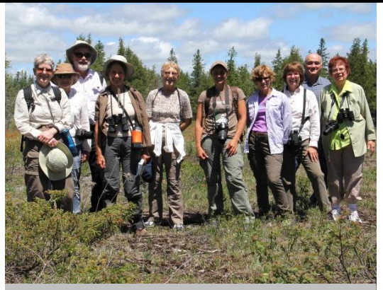
Passport to Nature participants learn about the unique species and landscape.

The Carden Challenge continues to be one of our best events, thanks to people like you who care for the alvar. That's not exactly a surprise though. Who wouldn't want to spend time exploring some of the land that our supporters help us to protect? Highlights this year included two bird species being added to the list and the delicious dinner prepared by the Ladies of Lake Dalrymple.