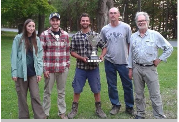
Team Lagerhead took the Carden Cup with 133 bird species counted in 24 hours.