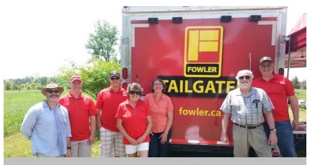
Thanks to Fowlers Construction for the wonderful lunch during the Carden Challenge.