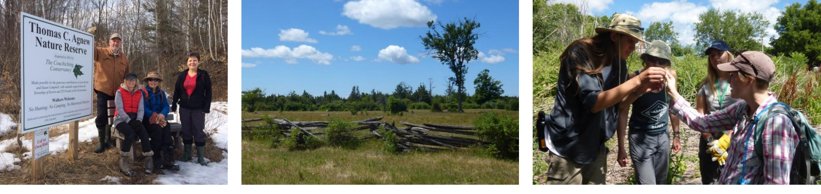
Protecting nature for current and future generations since 1993