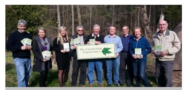
The Board of Directors help to launch the 2<sup>nd</sup> Passport to Nature.