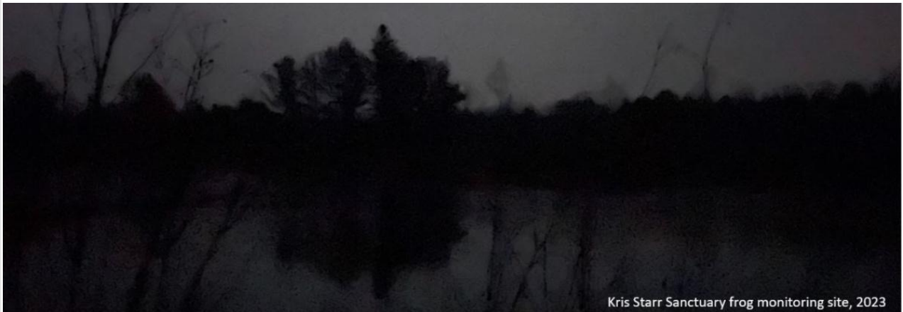
Kris Starr Sanctuary frog monitoring site, 2023