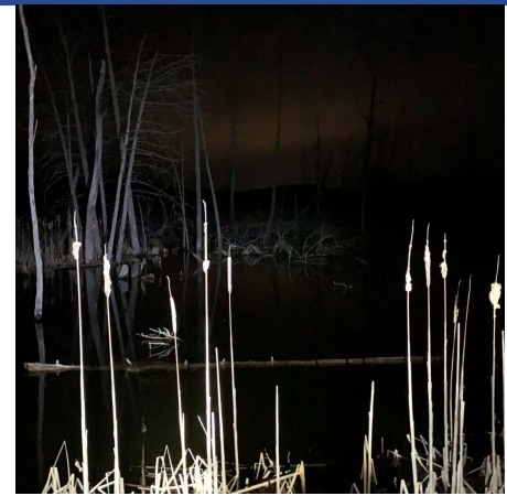
Copeland Forest wetland

Smoke from the fires could cause respiratory issues, make it harder to see/smell, and induce fear-based responses in some animals. But not much is known about the impacts of wildlife smoke on frogs.